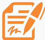
Permanent life insurance policy